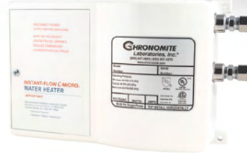
CHRONOMITE Since 1966 POINT OF USE TANKLESS Model No. CM Series